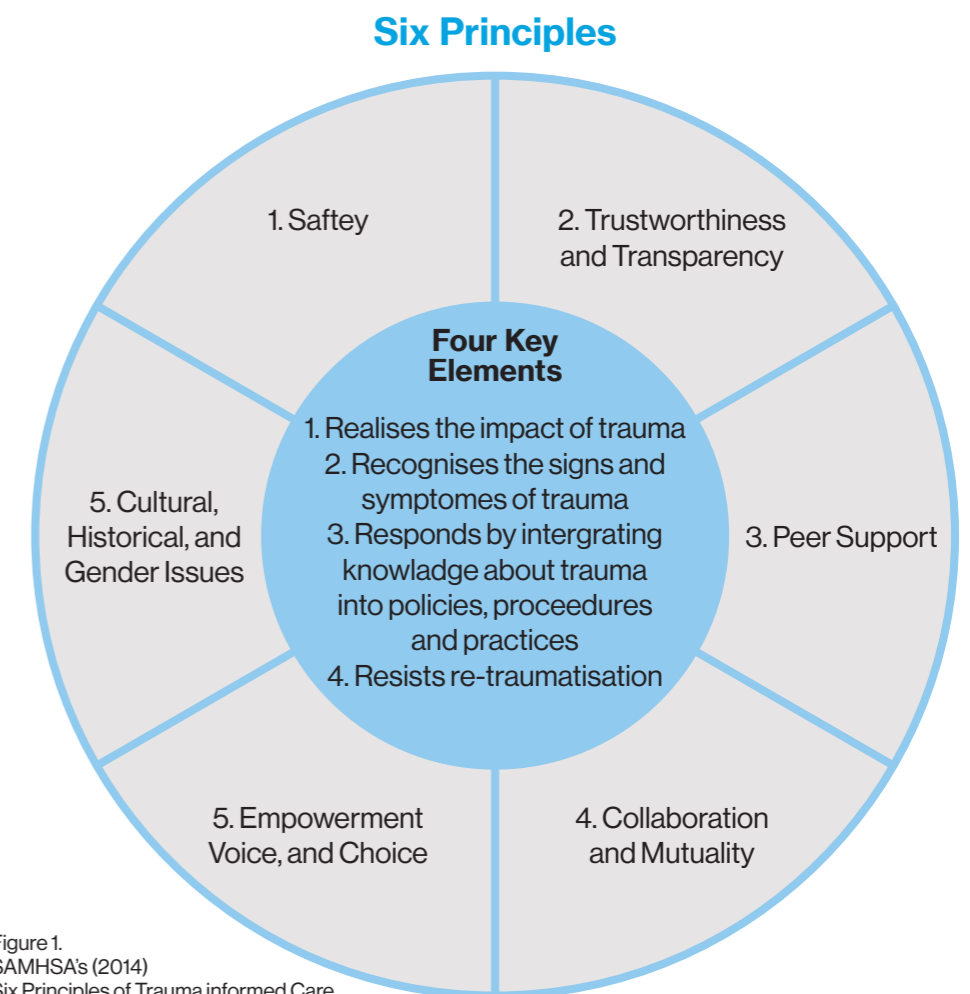
Figure 1. SAMHSA's (2014) Six Principles of Trauma informed Care

With an awareness of the impact of childhood adversity and trauma on people’s lives and behaviours over-time, TIC advocates developed a set of key assumptions and principles to help design responsive, holistic and effective systems of care. In bringing together a set of key principles, the effort is not to create a new set of rules, but rather to identify the core components of service culture, design and delivery that require attention (Figure 1). This includes paying attention to experience at all levels of the system, not only the service user/identified client, but also their caregivers (both families and professional caregivers), as well as practitioners, service managers and inter-agency interfaces.